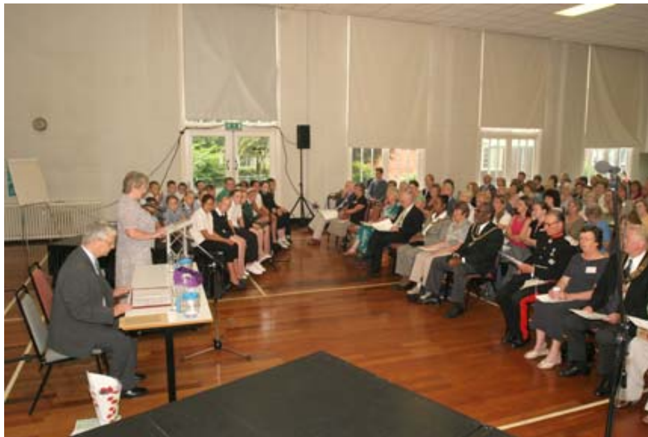
Bottom - View from the stage (no number available)