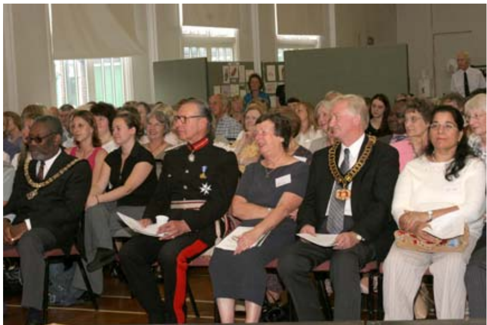
Bottom - A view of the crowded Hall at the Denewood Centre, Bilborough.